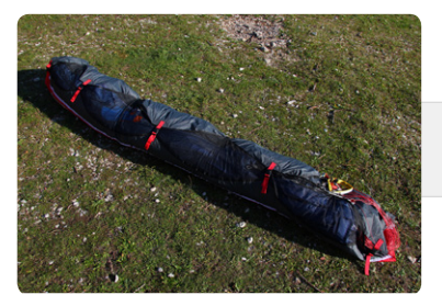
Step 9 . Turn the Concerto on its side and make the first fold just after the LE reinforcements. Do not fold the plastic reinforcements, use 2 folds around the LE.